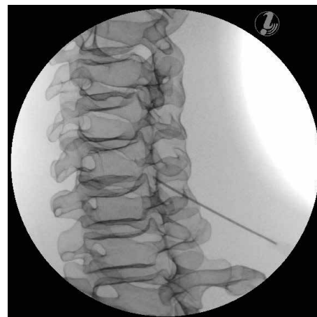
Interlaminar epidural contralateral oblique view