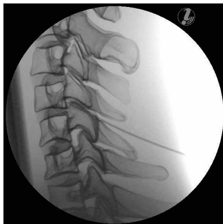
Interlaminar epidural lateral view