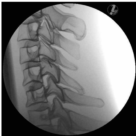
Intraarticular facet from lateral